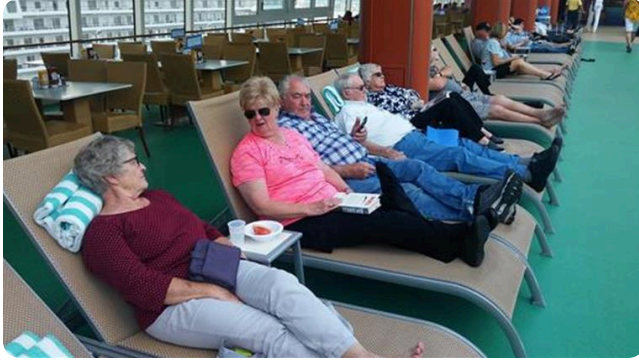
New England cruise with siblings